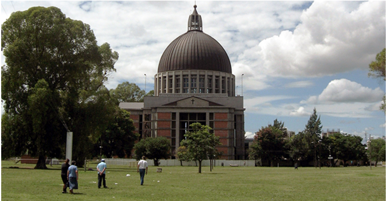
Sanctuary of Our Lady of the Rosary of San Nicholas – Province of Buenos Aires, Argentina