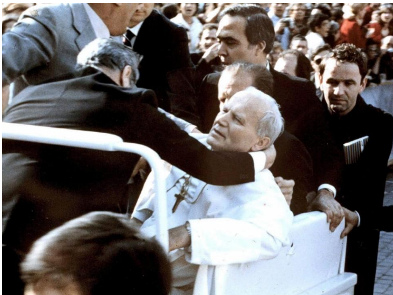
Pope John Paul II Recognized Himself as the Pope Dressed in White in the Third

While recovering in Rome's Gemelli Hospital he had the Fatima texts removed from the Vatican Archives and personally presented to him. Lying in the hospital, prayerfully studying the Fatima dossier, he recognized himself as the pope "dressed in white" spoken about in the "third secret", the pope whom Our Lady referred to when she told the children that the "holy father" would have much to suffer, implicitly at the hands of the communists.