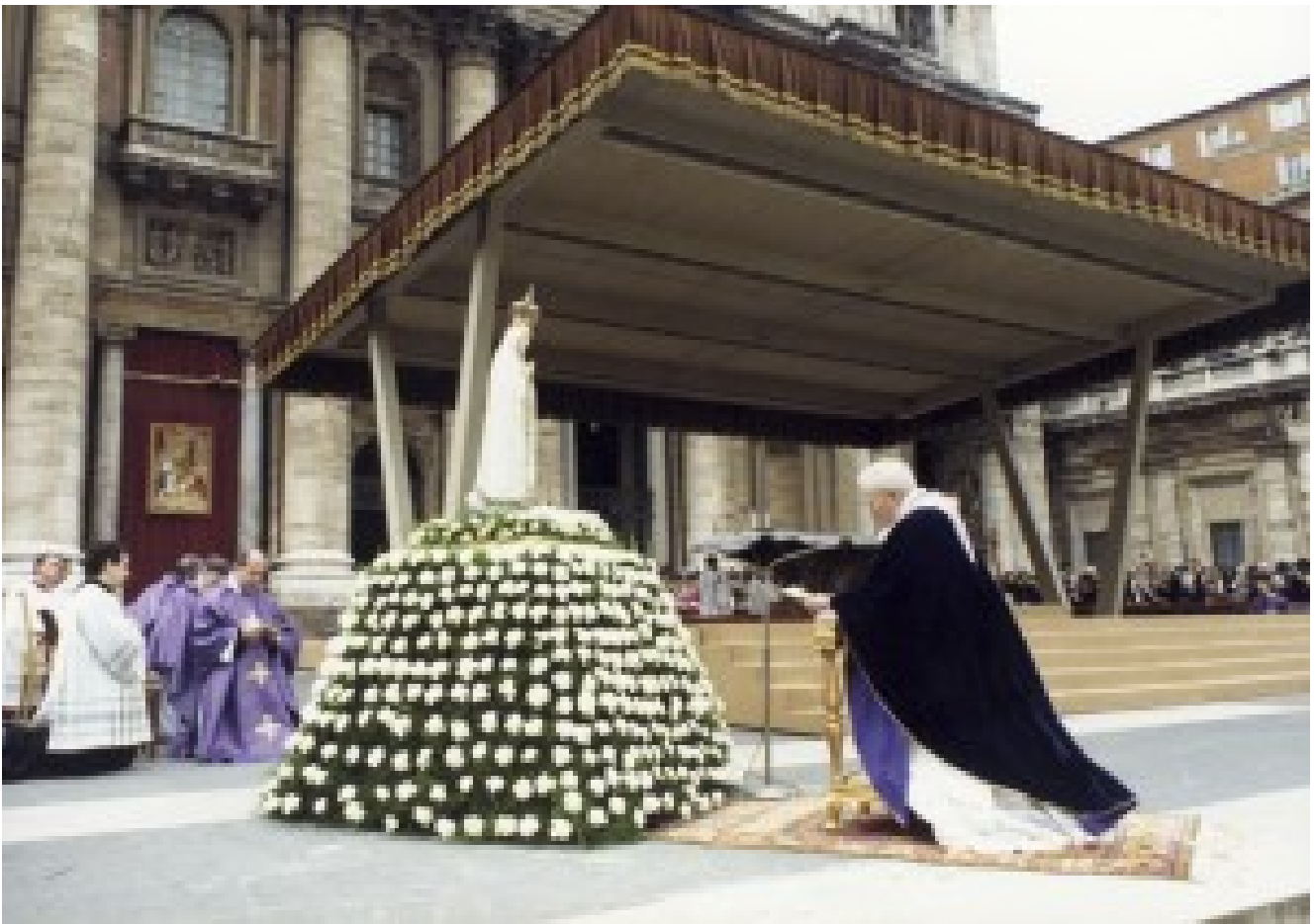
Pope John Paul II Consecrating the World to Our Lady of Fatima

Subsequently, he had the bullet removed from his body sent to Fatima to be placed in the crown of the Virgin statue. Then, on March 25, 1984, he proceeded to consecrate the world to Our Lady of Fatima in union with the bishops. Following that collegial act he then also decided to publicly reveal the much guarded “Third Secret of Fatima” for the first time since it was given to the children in 1917.