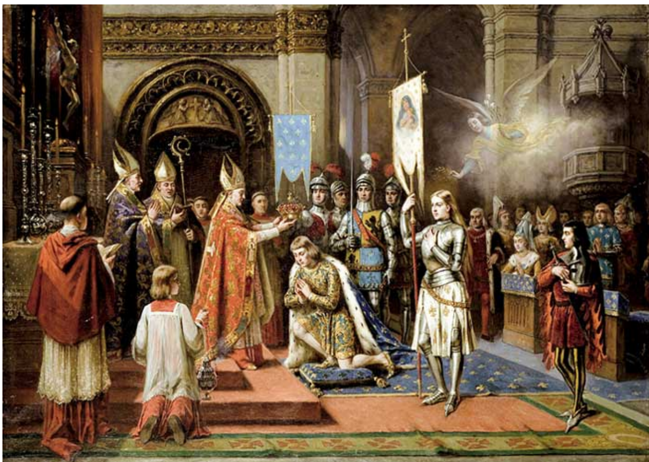
The Dauphin, Charles Crowned King of France at Reims: Attended by St. Joan of Arc

anointed with holy oil by the bishops at Reims thus becoming King Charles VII. No Catholic king can claim to rule by divine right unless the church approves, confirms, and anoints him, in which case, the king serves by right of the church and therefore, in Catholic countries, is subject to and can be disposed by the church.