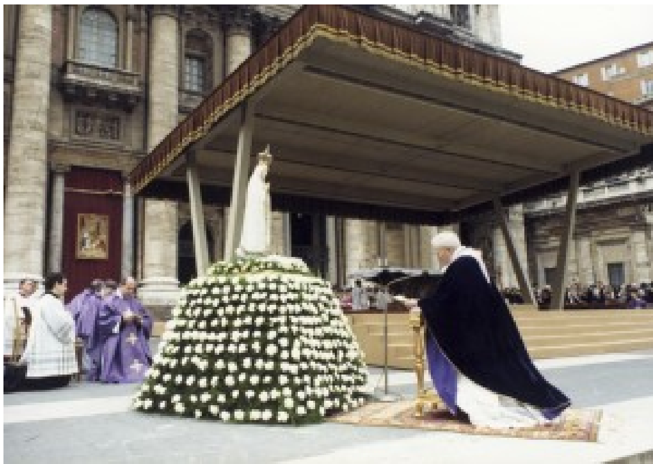
Pope John Paul II Consecrating the World to Our Lady of Fatima

Subsequently, he had the bullet removed from his body sent to Fatima to be placed in the crown of the Virgin statue. Then, on March 25, 1984, he proceeded to consecrate the world to Our Lady of Fatima in union with the bishops. Following that collegial act he then also decided to publicly reveal the much guarded “Third Secret of Fatima” for the first time since it was given to the children in 1917.