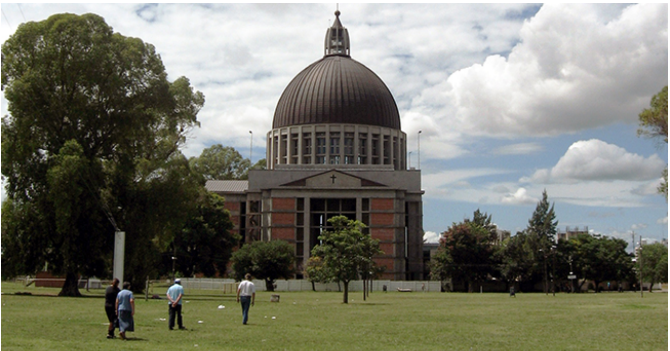
Sanctuary of Our Lady of the Rosary of San Nicholas – Province of Buenos Aires, Argentina