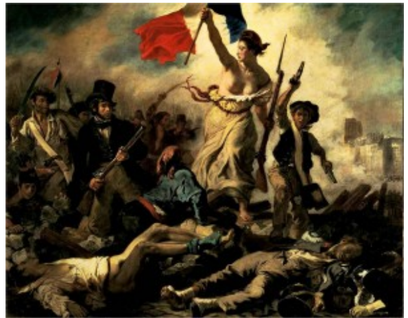
Lady Liberty as Depicted by the French

By the time she emerged, the Christian men and women of Europe had already spread the faith so far and wide that it would take nefarious skill, innuendo, monetary allurements, false promises of enlightenment, sexual liberation, her old use of double meaning and other surreptitious crafts to bring about a revolution in her name.