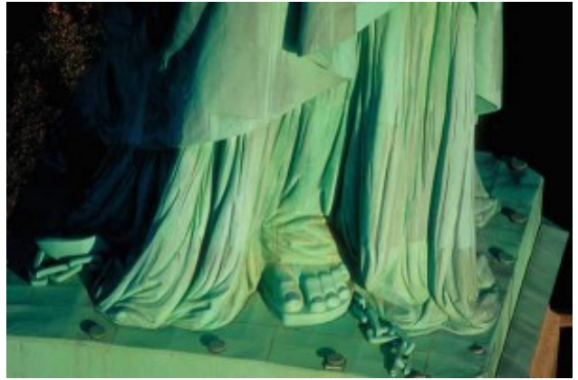
Sundered chains representing Freedom at feet of Liberty

Because Libertas represents light and liberty, she symbolizes power over tyrants and every form of tyranny that enslaves the minds of men; her power to liberate is symbolized by a sundered chain that lies prostrate at her feet. She symbolizes the apotheosis of freedom and hostility toward every form of tyranny, esp. that form recognized by Jefferson and Adams, which was the same form of tyranny violently opposed by the French, viz, the supposed tyranny of kings and clergy: