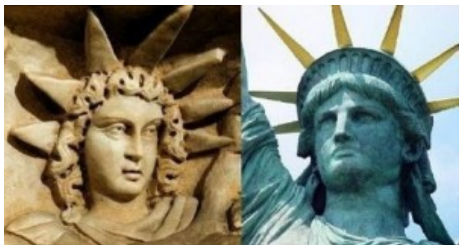
Babylonian Goddess Ishtar (Astarte) and Lady Liberty

Ancient Romans, esp. of the Republic, had a unique reverence for various virtues some of which (Justice, Courage, and Piety, to name a few) overtime, they personified and then elevated to the status of a god or goddess. Liberty was a Roman concept, a personified and highly esteemed virtue before she ever became a goddess. Her apotheosis was not achieved until 232 BC. By that time, her cult had grown popular enough to justify her being enshrined in the Roman pantheon. This feat was accomplished by Tiberius Gracchus, a Roman Tribune stepped in democratic virtue and military valor and known to history as a “ hero of the people ”. Gracchus, as champion pro populo , favored agrarian land reform and distribution (distributive justice) for which he was eventually assassinated by wealthy patricians. It was this Gracchus, known for his bravery and military valor and eminence in virtue, who constructed the first temple to Libertas on Aventine Hill.