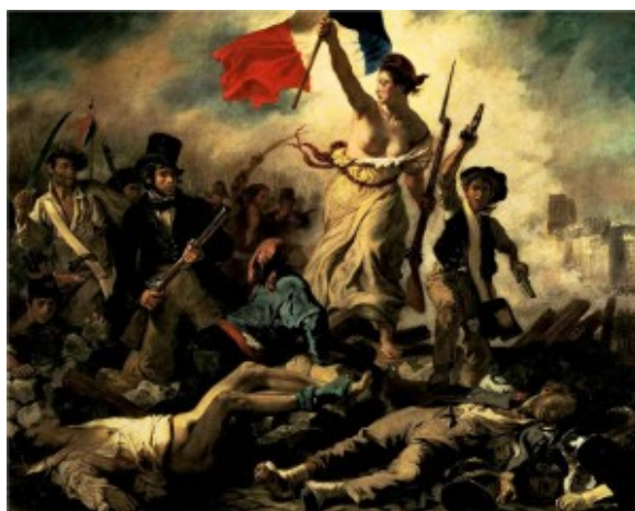
Lady Liberty as Depicted by the French

By the time she emerged, the Christian men and women of Europe had already spread the faith so far and wide that it would take nefarious skill, innuendo, monetary allurements, false promises of enlightenment, sexual liberation, her old use of double meaning and other surreptitious crafts to bring about a revolution in her name.