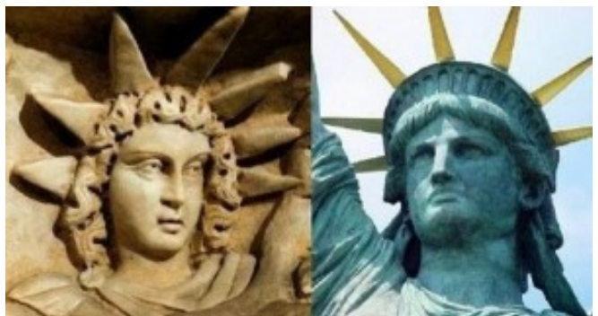
Babylonian Goddess Ishtar (Astarte) and Lady Liberty

Ancient Romans, esp. of the Republic, had a unique reverence for various virtues some of which (Justice, Courage, and Piety, to name a few) overtime, they personified and then elevated to the status of a god or goddess. Liberty was a Roman concept, a personified and highly esteemed virtue before she ever became a goddess. Her apotheosis was not achieved until 232 BC. By that time, her cult had grown popular enough to justify her being enshrined in the Roman pantheon. This feat was accomplished by Tiberius Gracchus, a Roman Tribune stepped in democratic virtue and military valor and known to history as a “ hero of the people ”. Gracchus, as champion pro populo , favored agrarian land reform and distribution (distributive justice) for which he was eventually assassinated by wealthy patricians. It was this Gracchus, known for his bravery and military valor and eminence in virtue, who constructed the first temple to Libertas on Aventine Hill.