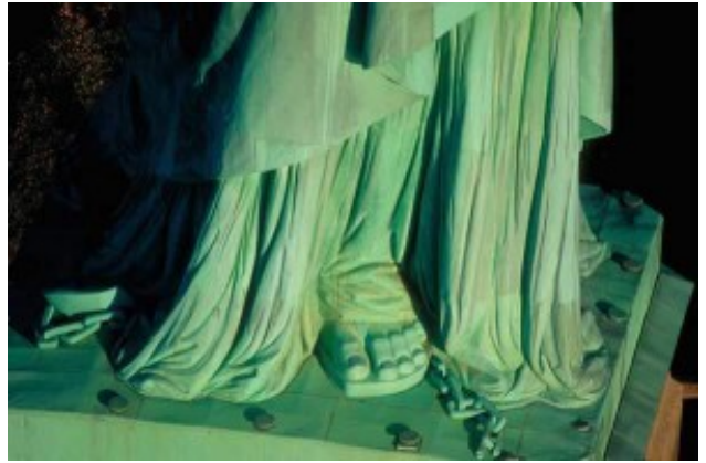
Sundered chains representing Freedom at feet of Liberty

Because Libertas represents light and liberty, she symbolizes power over tyrants and every form of tyranny that enslaves the minds of men; her power to liberate is symbolized by a sundered chain that lies prostrate at her feet. She symbolizes the apotheosis of freedom and hostility toward every form of tyranny, esp. that form recognized by Jefferson and Adams, which was the same form of tyranny violently opposed by the French, viz, the supposed tyranny of kings and clergy: