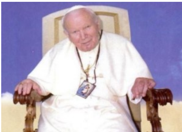
Pope John Paul II clothed in Brown Scapular

pledge. They have ratified this privilege of eternal salvation, salvation that comes through the eternal merits of the life, death, and resurrection of Jesus Christ assisted by His heavenly Mother, the Woman clothed with the Sun. She has promised all of Her children, those who die clothed in Her Brown Scapular, those who have perseveringly and devoutly served Her Son, She has promised to assist them all with the grace of final perseverance in holiness and the grace of final penitence by which they are saved from eternal fire . Some of the popes who have ratified this maternal promise include: Pope Alexander V, Pope Nicholas V, Pope Sixtus IV, Pope Clement VII, Pope Paul III, Pope St. Pius V, Pope Clement VIII, Pope Leo XI, Pope Paul V, Pope Urban VIII, Pope Alexander VII, Pope Benedict XIV, Pope Pius VI, Pope St. Pius X, Pope Benedict XV, Pope Pius XI and Pope Saint John Paul II who died clothed in his scapular.