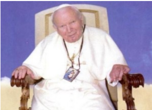
Pope John Paul II clothed in Brown Scapular

pledge. They have ratified this privilege of eternal salvation, salvation that comes through the eternal merits of the life, death, and resurrection of Jesus Christ assisted by His heavenly Mother, the Woman clothed with the Sun. She has promised all of Her children, those who die clothed in Her Brown Scapular, those who have perseveringly and devoutly served Her Son, She has promised to assist them all with the grace of final perseverance in holiness and the grace of final penitence by which they are saved from eternal fire . Some of the popes who have ratified this maternal promise include: Pope Alexander V, Pope Nicholas V, Pope Sixtus IV, Pope Clement VII, Pope Paul III, Pope St. Pius V, Pope Clement VIII, Pope Leo XI, Pope Paul V, Pope Urban VIII, Pope Alexander VII, Pope Benedict XIV, Pope Pius VI, Pope St. Pius X, Pope Benedict XV, Pope Pius XI and Pope Saint John Paul II who died clothed in his scapular.