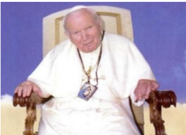
Pope John Paul II clothed in Brown Scapular

pledge. They have ratified this privilege of eternal salvation, salvation that comes through the eternal merits of the life, death, and resurrection of Jesus Christ assisted by His heavenly Mother, the Woman clothed with the Sun. She has promised all of Her children, those who die clothed in Her Brown Scapular, those who have perseveringly and devoutly served Her Son, She has promised to assist them all with the grace of final perseverance in holiness and the grace of final penitence by which they are saved from eternal fire . Some of the popes who have ratified this maternal promise include: Pope Alexander V, Pope Nicholas V, Pope Sixtus IV, Pope Clement VII, Pope Paul III, Pope St. Pius V, Pope Clement VIII, Pope Leo XI, Pope Paul V, Pope Urban VIII, Pope Alexander VII, Pope Benedict XIV, Pope Pius VI, Pope St. Pius X, Pope Benedict XV, Pope Pius XI and Pope Saint John Paul II who died clothed in his scapular.