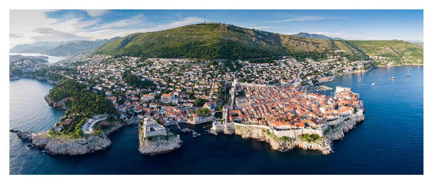
Dubrovnik in Southern Croatia

Before the Communist breakup under M. Gorbachev, Bosnia was a province of Yugoslavia. Yugoslavia was the pearl in an otherwise rusty crown of Communist states. Yugoslavia offered Western consumer goods, exported high quality modern mechanical products including the Yugo automobile, and was a highly desired tourist attraction boasting splendid cities, beautiful mountain lakes, an inspiring coast, and spectacular mountain scenery.