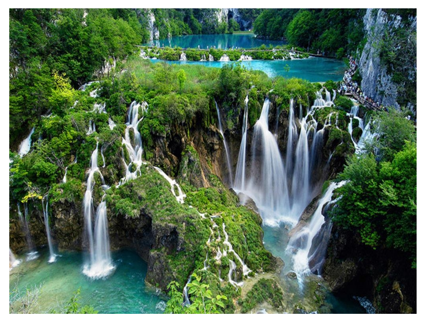
Plitvice Lakes National Park, Croatia

Nonetheless, there was much discontent, esp. in Catholic Croatia where Catholics regularly suffered oppression and heinous treatment at the hands of their Serbian Communist overlords, which sparked a covert nationalist undercurrent known as the Ustasa, a group of Catholic insurrectionists that took up arms against the Communist Government and government officials. Poland, another country situated in Eastern Europe, also faced a hostile Communist regime; however, unlike the Ustasas, the Poles rallied peacefully under the banner of Solidarity, a social movement inspired by bishops and cardinals opposed to violence in favor of peaceful protest fueled by prayer and sacrifice, the traditional Catholic form of resistance ever since the first martyrs peacefully witnessed for the faith and had their blood spilled throughout the anti-Christian Roman Empire. Things were quite different in Croatia where a minority of zealous insurrectionists decided to resolve the issue through more violence. At the center of the turmoil was a small relatively unknown town named Medjugorje , the