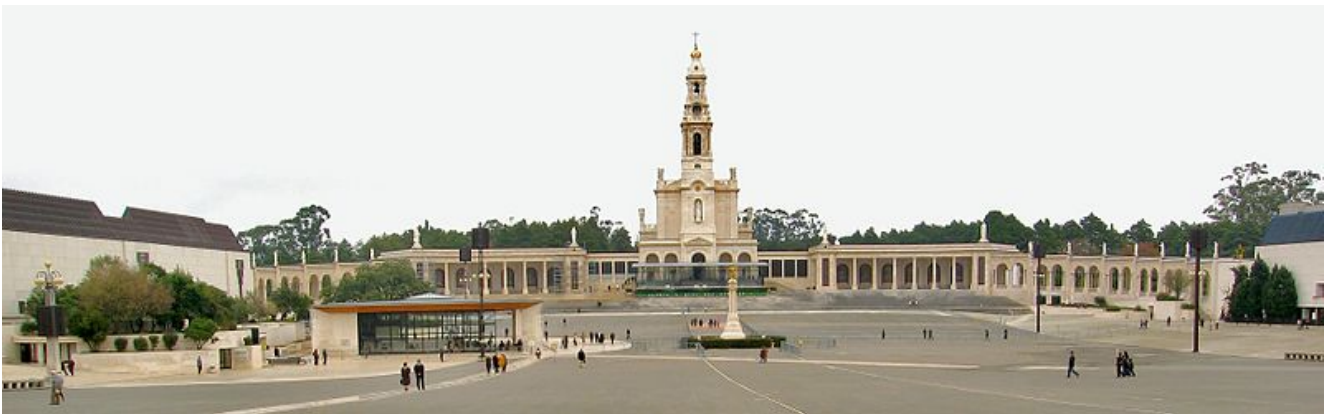
Panoramic view of the Sanctuary of Our Lady of Fátima with the Chapel of the Apparitions and the Basilica of Our Lady of the Rosary