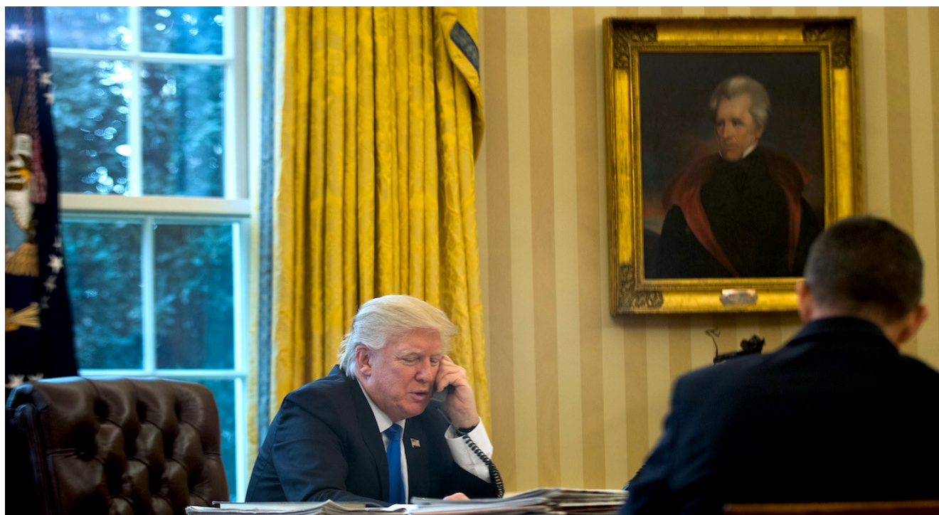
President Trump in the Oval Office with Picture of President Andrew Jackson Conspicuously Hovering over His Executive Desk

Nonetheless, for these sanctions to be successful, the President as the Executive arm of government must be willing to enforce them. His threat not to do so is not without precedent; he could always pull an Andrew Jackson and refuse.