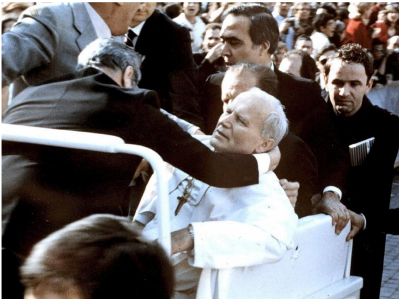
Pope John Paul II Recognized Himself as the Pope Dressed in White in the Third

While recovering in Rome’s Gemelli Hospital he had the Fatima texts removed from the Vatican Archives and personally presented to him. Lying in the hospital, prayerfully studying the Fatima dossier, he recognized himself as the pope “dressed in white” spoken about in the “third secret”, the pope whom Our Lady referred to when she told the children that the “holy father” would have much to suffer, implicitly at the hands of the communists.