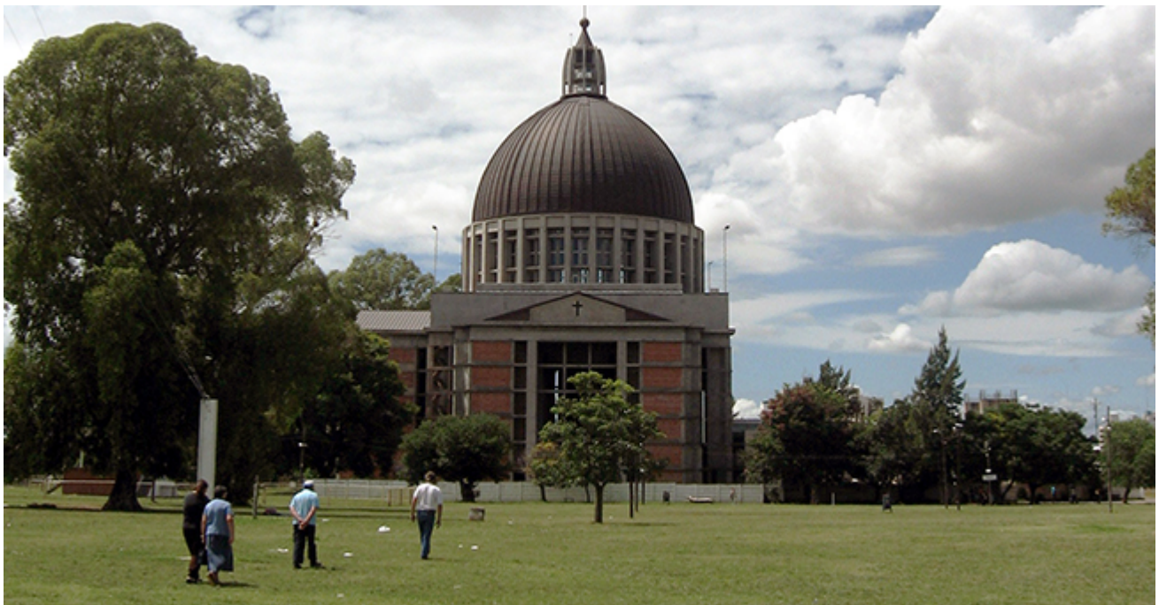
Sanctuary of Our Lady of the Rosary of San Nicholas – Province of Buenos Aires, Argentina