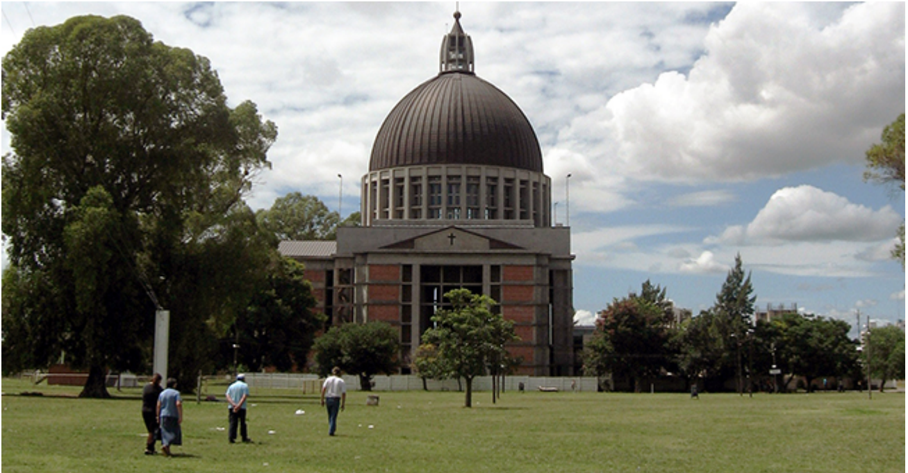
Sanctuary of Our Lady of the Rosary of San Nicholas – Province of Buenos Aires, Argentina