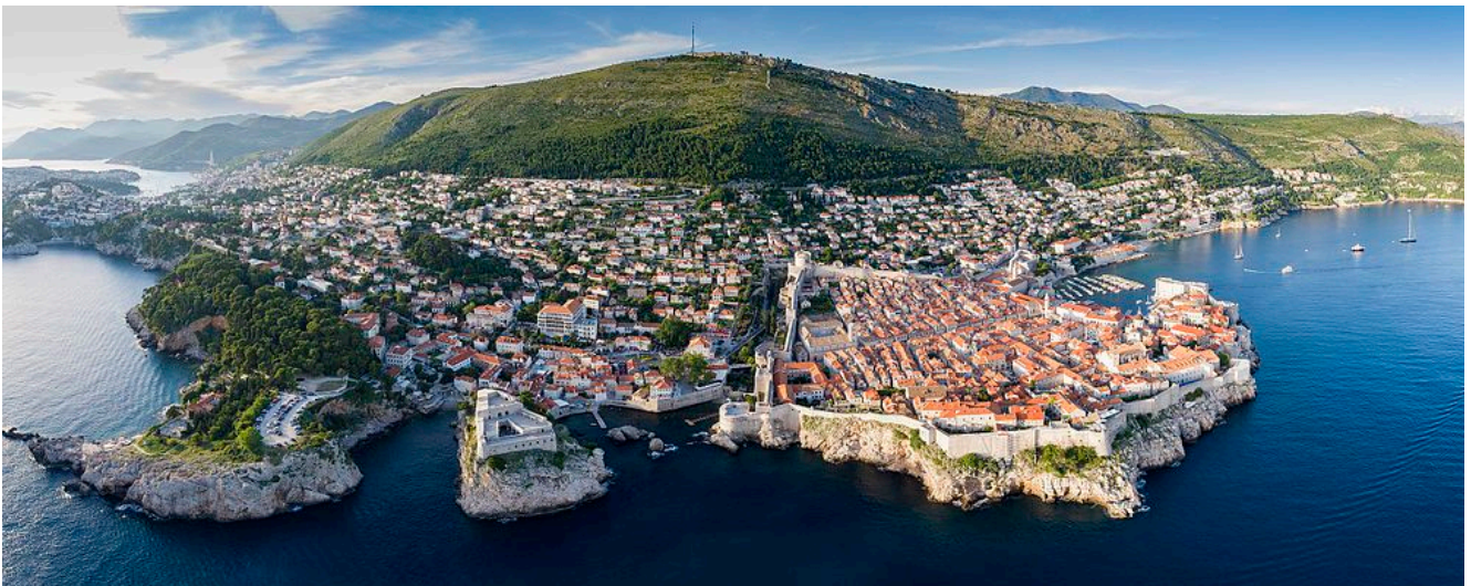
Dubrovnik in Southern Croatia

Before the Communist breakup under M. Gorbachev, Bosnia was a province of Yugoslavia. Yugoslavia was the pearl in an otherwise rusty crown of Communist states. Yugoslavia offered Western consumer goods, exported high quality modern mechanical products including the Yugo automobile, and was a highly desired tourist attraction boasting splendid cities, beautiful mountain lakes, an inspiring coast, and spectacular mountain scenery.