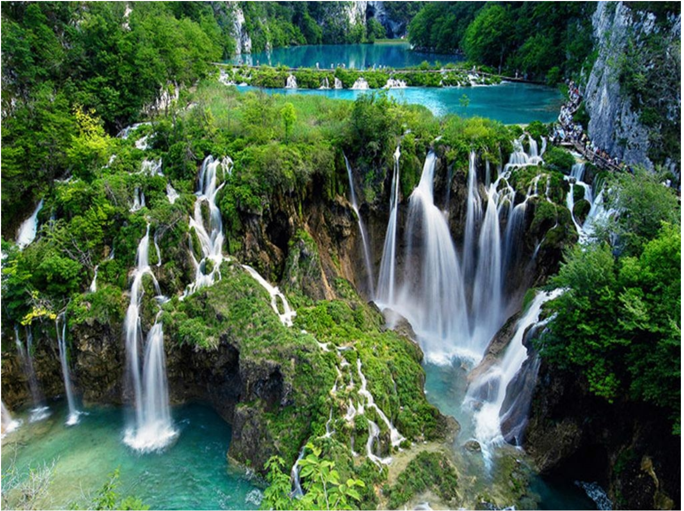
Plitvice Lakes National Park, Croatia

Nonetheless, there was much discontent, esp. in Catholic Croatia where Catholics regularly suffered oppression and heinous treatment at the hands of their Serbian Communist overlords, which sparked a covert nationalist undercurrent known as the Ustasa, a group of Catholic insurrectionists that took up arms against the Communist Government and government officials. Poland, another country situated in Eastern Europe, also faced a hostile Communist regime; however, unlike the Ustasas, the Poles rallied peacefully under the banner of Solidarity , a social movement inspired by bishops and cardinals opposed to violence in favor of peaceful protest fueled by prayer and sacrifice, the traditional Catholic form of resistance ever since the first martyrs peacefully witnessed for the faith and had their blood spilled throughout the anti-Christian Roman Empire. Things were quite different in Croatia where a minority of zealous insurrectionists decided to resolve the issue through more violence. At the center of the turmoil was a small relatively unknown town named Medjugorje , the