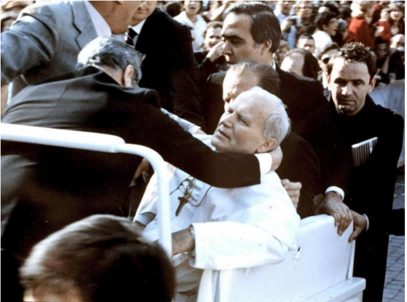
Pope John Paul II Recognized Himself as the Pope Dressed in White in the Third Secret of Fatima

Subsequently, he had the bullet removed from his body sent to Fatima to be placed in the crown of the Virgin statue. Then, on March 25, 1984, he proceeded to consecrate the world to Our Lady of Fatima in union with the bishops. Following that collegial act he then also decided to publicly reveal the much guarded "Third Secret of Fatima" for the first time since it was given to the children in 1917.