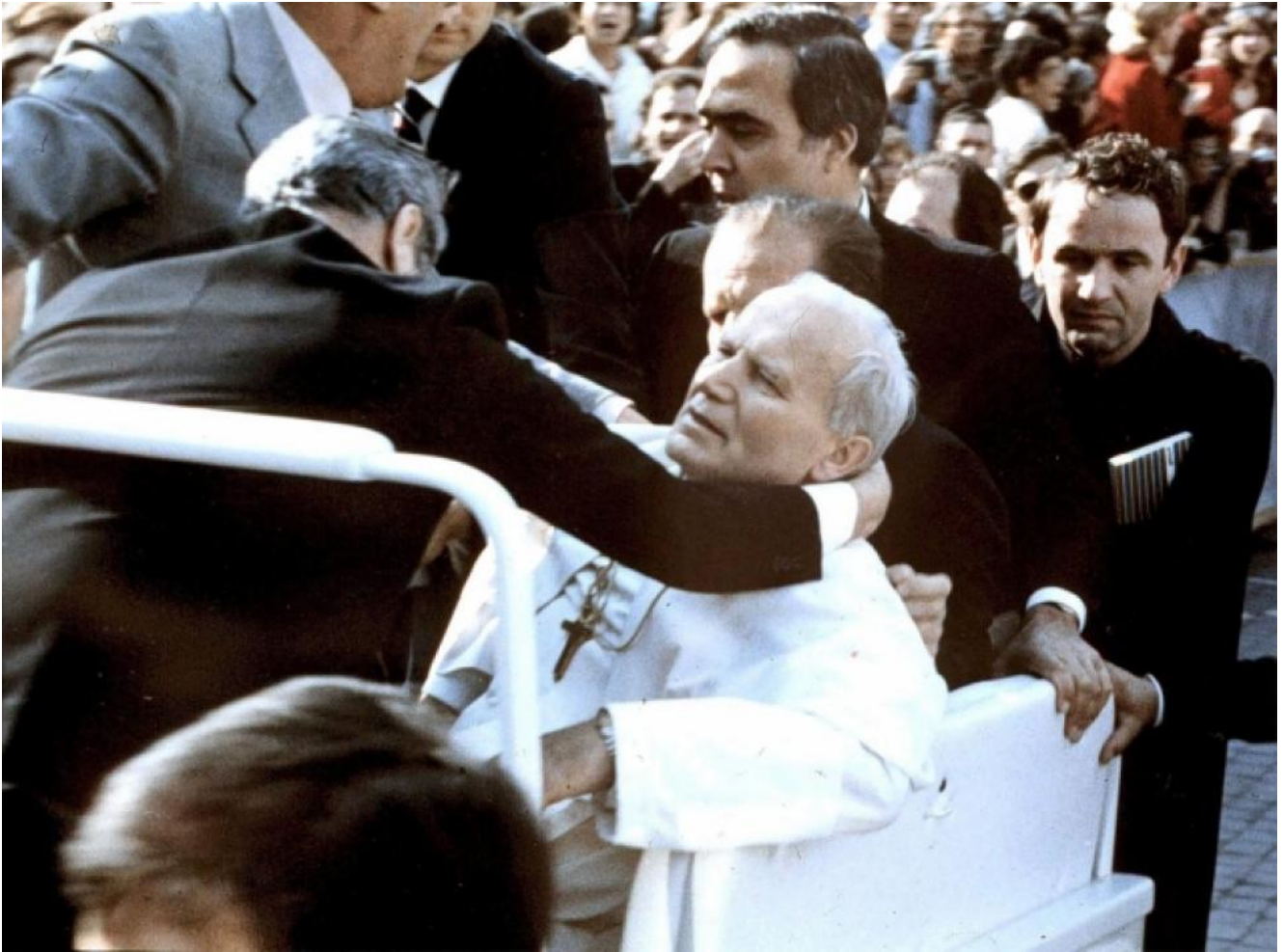
Pope John Paul II Recognized Himself as the Pope Dressed in White in the Third Secret of Fatima

Subsequently, he had the bullet removed from his body sent to Fatima to be placed in the crown of the Virgin statue. Then, on March 25, 1984, he proceeded to consecrate the world to Our Lady of Fatima in union with the bishops. Following that collegial act he then also decided to publicly reveal the much guarded "Third Secret of Fatima" for the first time since it was given to the children in 1917.