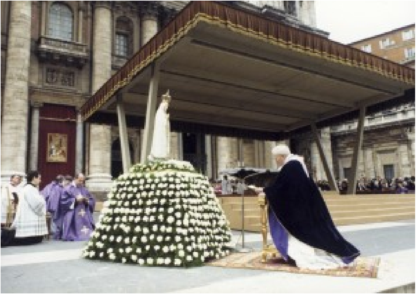
Pope John Paul II Consecrating the World to Our Lady of Fatima

Following the 1984 papal consecration, as promised, communism was toppled, the Solidarity movement gained momentum in Poland, the Berlin wall came down and one after another the nations behind the “Iron Curtain” were given political and then religious freedom – Russia was being converted as Our Lady of Fatima had promised.