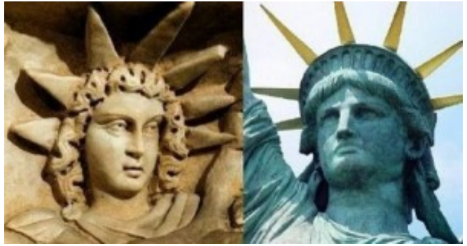
Babylonian Goddess Ishtar (Astarte) and Lady Liberty

How does liberty a pure virtue personified and then deified as the goddess Libertas ( liberty as a concept was also worshiped as the goddess Libera and her male counterpart, the god, Liber [Roman form of the Greek known Bacchus] who are not considered in this analysis – essentially all three represent the same concept of freedom ), the champion of Roman valor and liberty, become a slave master and connoisseur of debauchery as she is presented in the writings of many ultraconservative Christians who claim that the American Statue of liberty” is a replica of Ishtar, Astarte or the Greek Aphrodite? What we find in their voluminous writings about the Statue of Liberty being a pagan goddess with roots reaching back to the mystery cults of Babylon seems to me unsupported conjecture. For example, Cicero is quoted as saying Libertas was the “Mother of Harlots”, but as is often the case, specious scholarship fails to provide proper citations by which to verify their statements. [1] Perhaps the seven spiked crown above Liberty’s head represents the 7 crowns of light in esoteric lore, perhaps she is a rendition of the pagan goddess Astarte, perhaps – it is all conjecture. It is highly improbable, that a righteous champion of the people, like Tiberius Gracchus, would favor a debauched libertine or promote a whoring goddess. However, a debauched libertine and friend of esotericism like Publius Clodius Pulcher (58 BC) might.