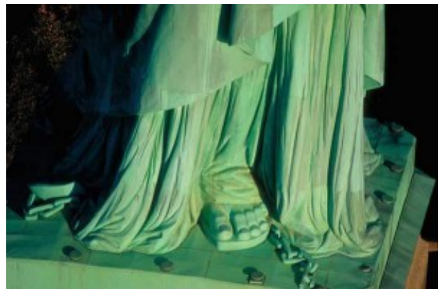
Sundered chains representing Freedom at feet of Liberty

French sculptor, Frederic Auguste Bartholdi. The statue represents the Roman goddess Libertas ; in her jubilant right hand, stretched toward heaven, she holds forth a perpetual flame and in her left, she holds a tablet on which is inscribed, "July 4, 1776", the monumental day that Thomas Jefferson, assisted by Ben Franklin, John Adams, Robert Livingston, and Roger Sherman presented the Declaration of Independence to the Second Continental Congress by which it was solemnly approved and promulgated.