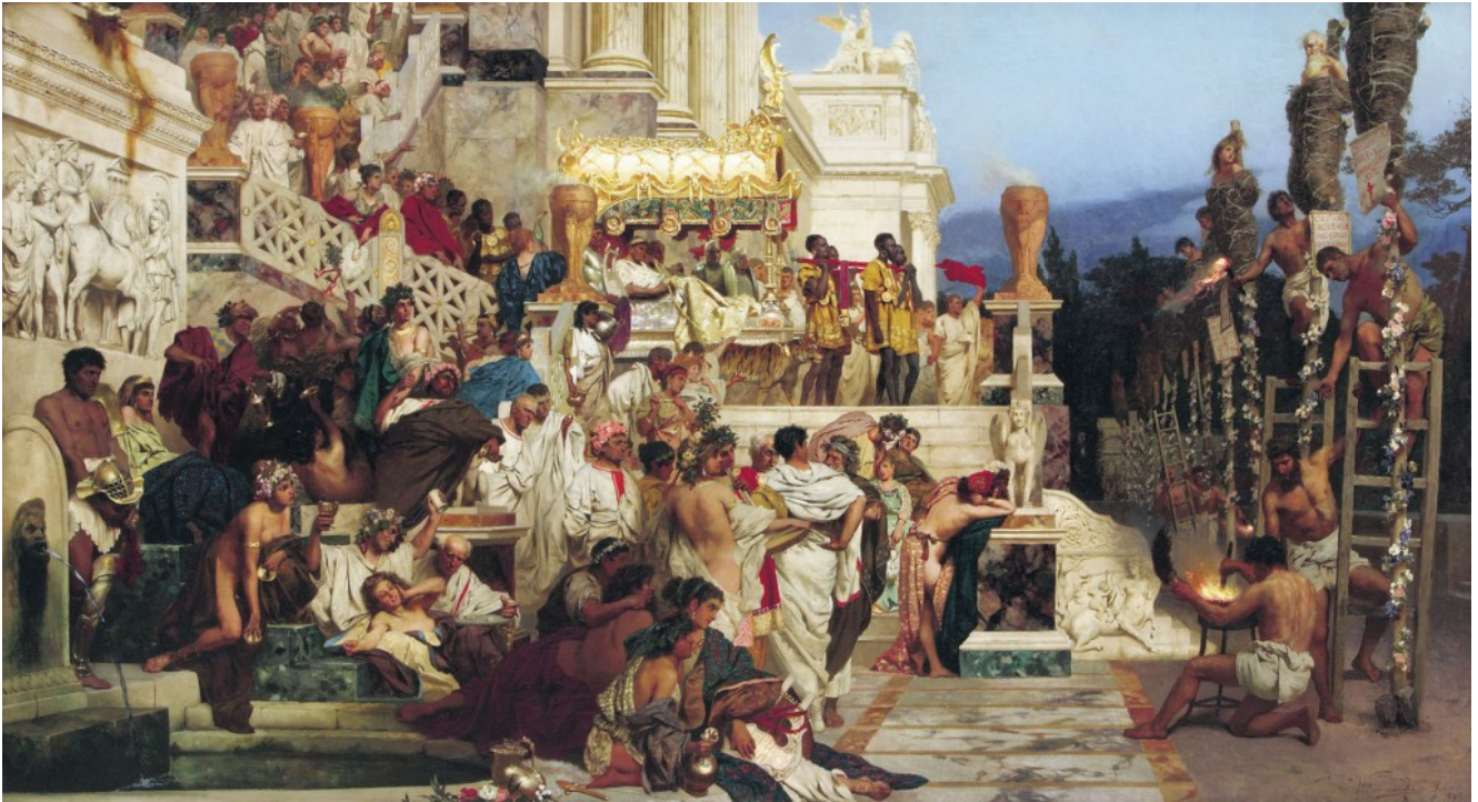
The Torches of Nero, by Henryk Siemiradzki: Nero an Effeminate Glutton using Christians as Human Torches to Satisfy his Concupiscence

"I saw a woman seated on a scarlet beast that was covered with blasphemous names, with seven heads and ten horns. And the woman was clothed roundabout with purple and scarlet, and gilt with gold, and precious stones and pearls, having a golden cup in her hand, full of the abomination and filthiness of her fornication. And on her forehead a name was written: A mystery; Babylon the great, the mother of the fornications, and the abominations of the earth. And I saw the woman drunk with the blood of the saints, and with the blood of the martyrs of Jesus. And I wondered, when I had seen her, with great admiration" (Rev. 17: 3-6) .