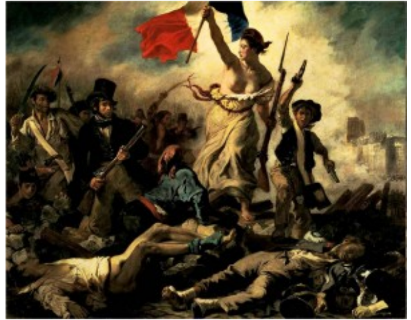
Lady Liberty as Depicted by the French

of double meaning and other surreptitious crafts to bring about a revolution in her name.