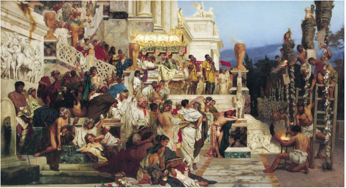
The Torches of Nero, by Henryk Siemiradzki: Nero an Effeminate Glutton using Christians as Human Torches to Satisfy his Concupiscence

"I saw a woman seated on a scarlet beast that was covered with blasphemous names, with seven heads and ten horns. And the woman was clothed roundabout with purple and scarlet, and gilt with gold, and precious stones and pearls, having a golden cup in her hand, full of the abomination and filthiness of her fornication. And on her forehead a name was written: A mystery; Babylon the great, the mother of the fornications, and the abominations of the earth. And I saw the woman drunk with the blood of the saints, and with the blood of the martyrs of Jesus. And I wondered, when I had seen her, with great admiration" (Rev. 17: 3-6) .