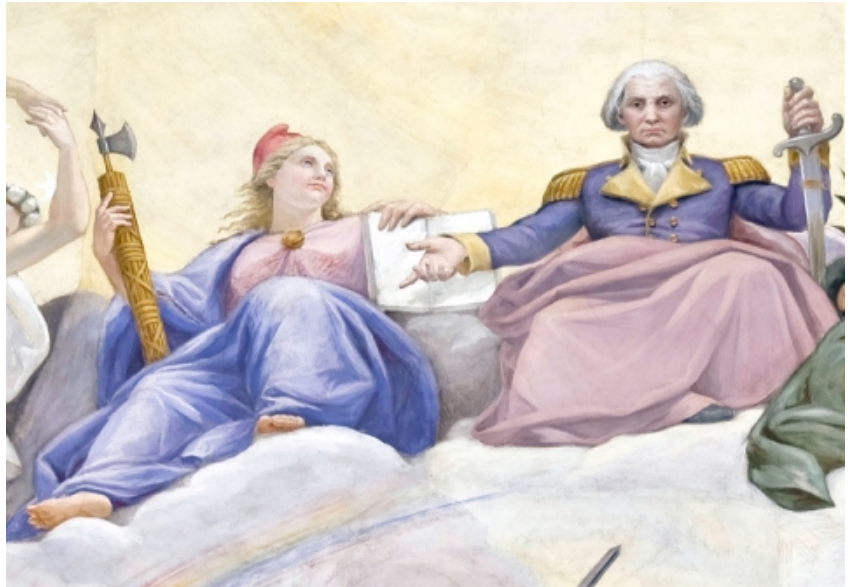
Lady Liberty wearing the pileus along with her good servant General George Washington who led a Revolution to set men and women free in her name).

— Libertas was thus transformed from a goddess of virtuous freemen and emancipated slaves, as she was honored during the Roman Republic, into the “Goddess of Slaves” during the Roman Empire. She became the “Goddess of Slaves” because those who sang her praises the loudest, those who daily demanded ever more liberty, were the very ones being enslaved by concupiscence while believing themselves to be free. Libertas was not only honored by foolish men and women in the process of being enslaved; she was also honored by obedient Gnostic adepts, men who consciously committed themselves to her, while she feigned love for them by economic favors and positions of power.