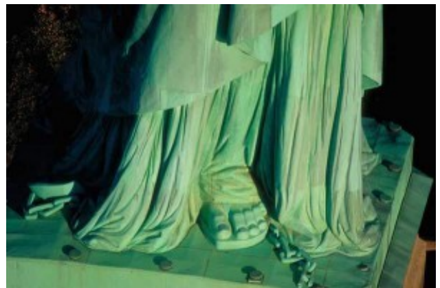
Sundered chains representing Freedom at feet of Liberty

French sculptor, Frederic Auguste Bartholdi. The statue represents the Roman goddess Libertas ; in her jubilant right hand, stretched toward heaven, she holds forth a perpetual flame and in her left, she holds a tablet on which is inscribed, "July 4, 1776", the monumental day that Thomas Jefferson, assisted by Ben Franklin, John Adams, Robert Livingston, and Roger Sherman presented the Declaration of Independence to the Second Continental Congress by which it was solemnly approved and promulgated.