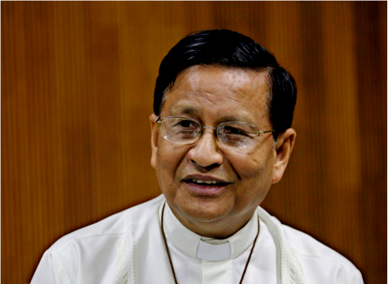
Cardinal Archbishop Charles Muang Bo of Yangon Member of the Salesian order and First Cardinal of Myanmar