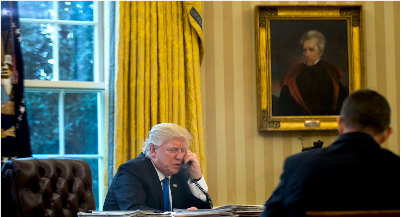
President Trump in the Oval Office with Picture of President Andrew Jackson Conspicuously Hovering over His Executive Desk