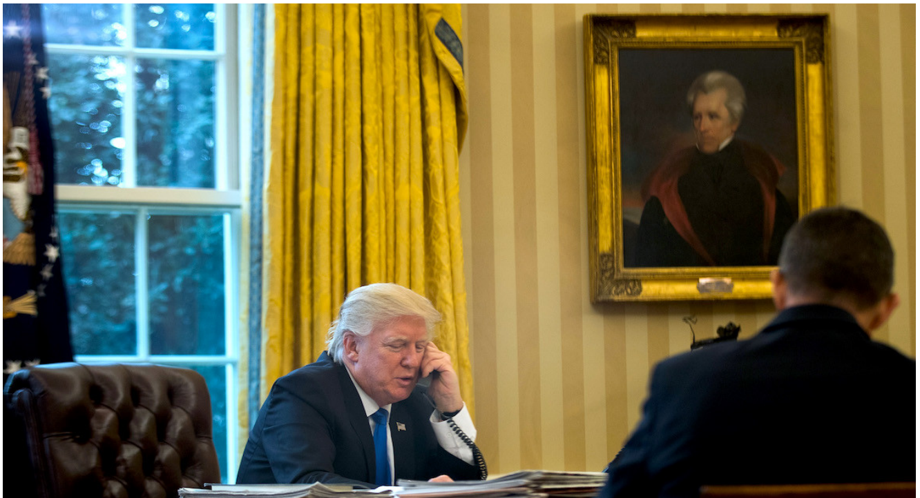
President Trump in the Oval Office with Picture of President Andrew Jackson Conspicuously Hovering over His Executive Desk

Nonetheless, for these sanctions to be successful, the President as the Executive arm of government must be willing to enforce them. His threat not to do so is not without precedent; he could always pull an Andrew Jackson and refuse.