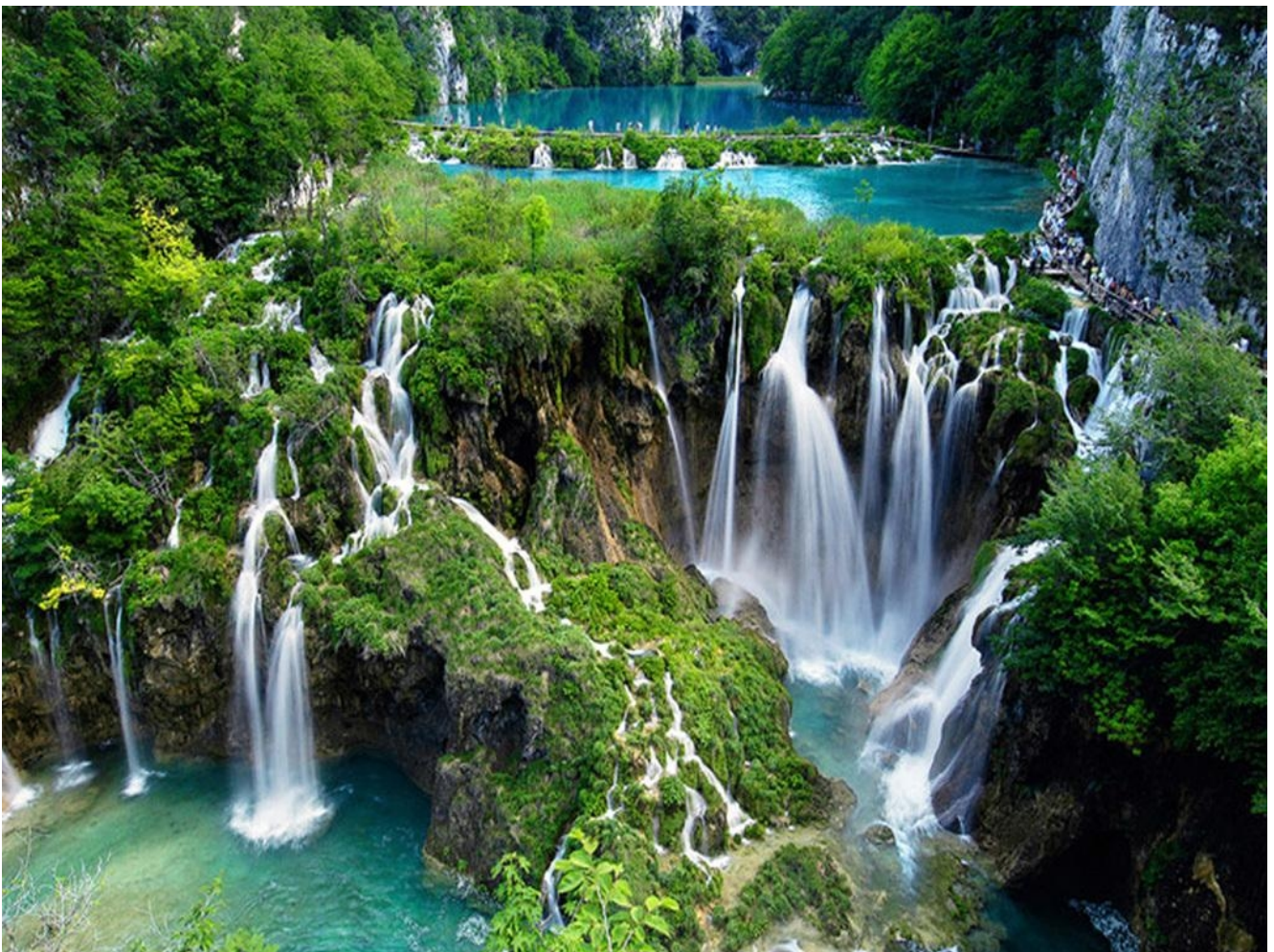
Plitvice Lakes National Park, Croatia

Nonetheless, there was much discontent, esp. in Catholic Croatia where Catholics regularly suffered oppression and heinous treatment at the hands of their Serbian Communist overlords, which sparked a covert nationalist undercurrent known as the Ustasa, a group of Catholic