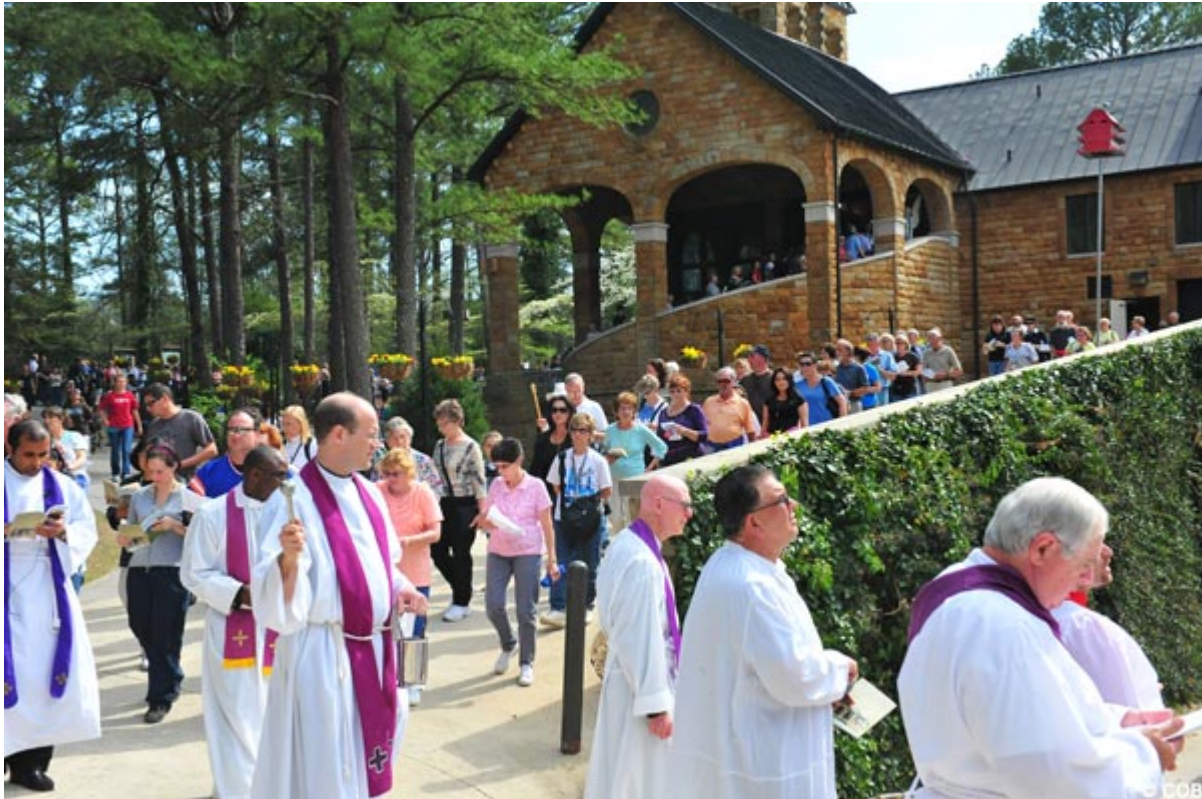
Pilgrims process in front of Main Building on the Caritas grounds in Birmingham, Alabama