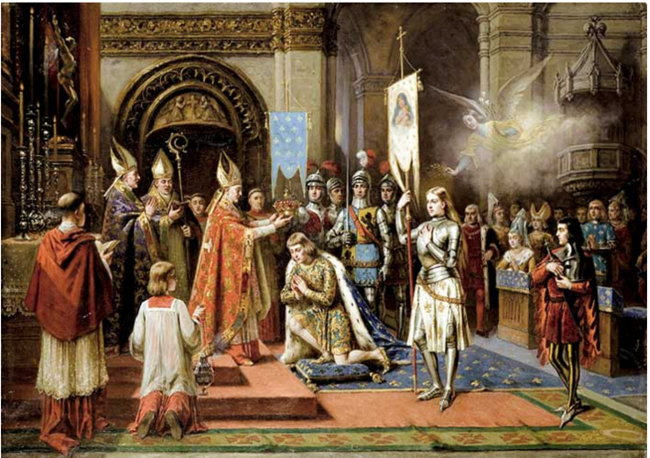
The Dauphin, Charles Crowned King of France at Reims: Attended by St. Joan of Arc

Because that is well understood, the Catholic Church never accepted the idea of divine right or the idea of absolutism that falsely attends it. All Catholic monarchs are confirmed and consecrated by the Church; this is why Saint Joan of Arc went to such trouble to have Charles the Dauphin crowned and anointed with holy oil by the bishops at Reims thus becoming King Charles VII. No Catholic king can claim to rule by divine right unless the church approves, confirms, and anoints him, in which case, the king serves by right of the church and therefore, in Catholic countries, is subject to and can be disposed by the church.