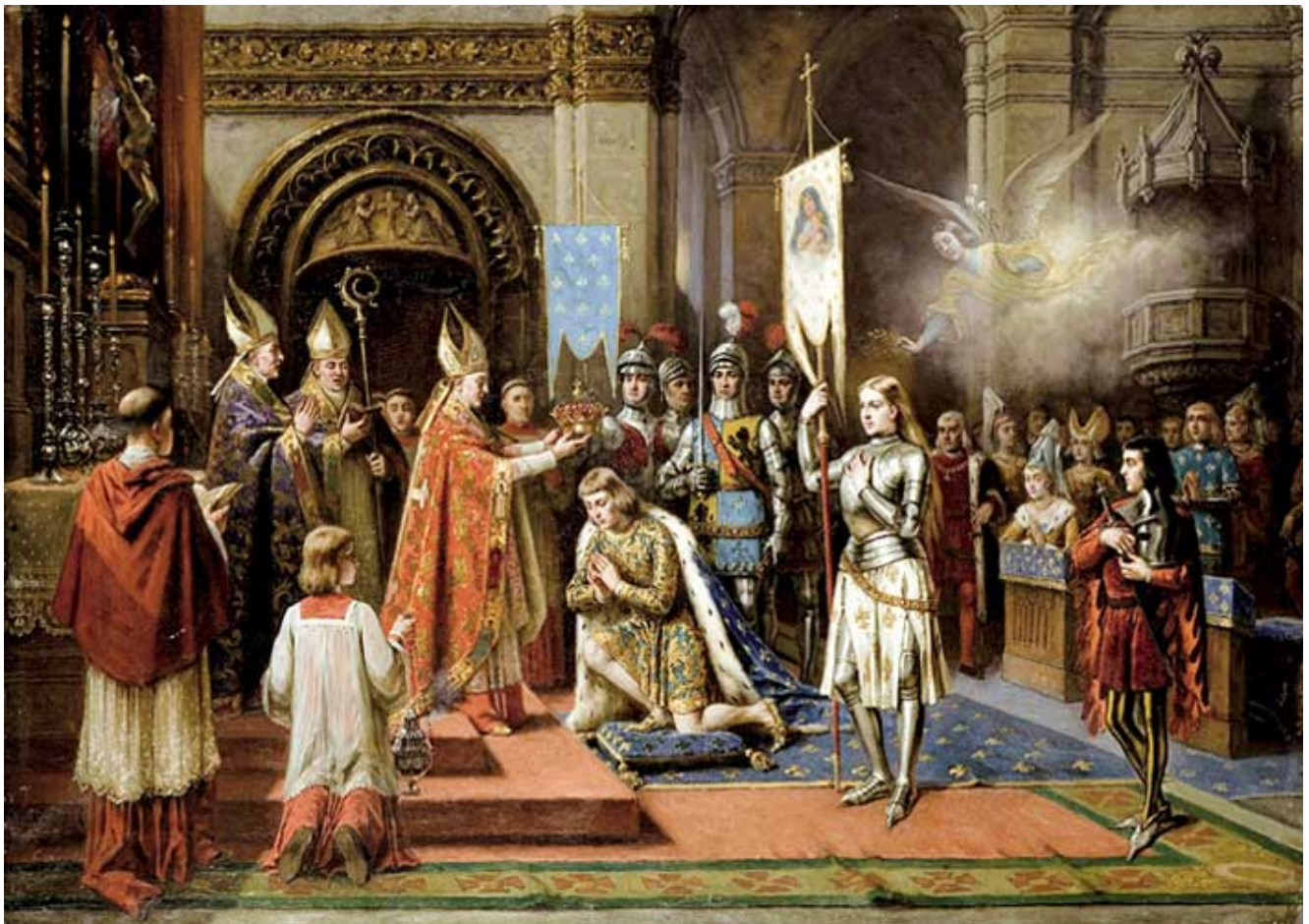
The Dauphin, Charles Crowned King of France at Reims: Attended by St. Joan of Arc

Because that is well understood, the Catholic Church never accepted the idea of divine right or the idea of absolutism that falsely attends it. All Catholic monarchs are confirmed and consecrated by the Church; this is why Saint Joan of Arc went to such trouble to have Charles the Dauphin crowned and anointed with holy oil by the bishops at Reims thus becoming King Charles VII. No Catholic king can claim to rule by divine right unless the church approves, confirms, and anoints him, in which case, the king serves by right of the church and therefore, in Catholic countries, is subject to and can be disposed by the church.