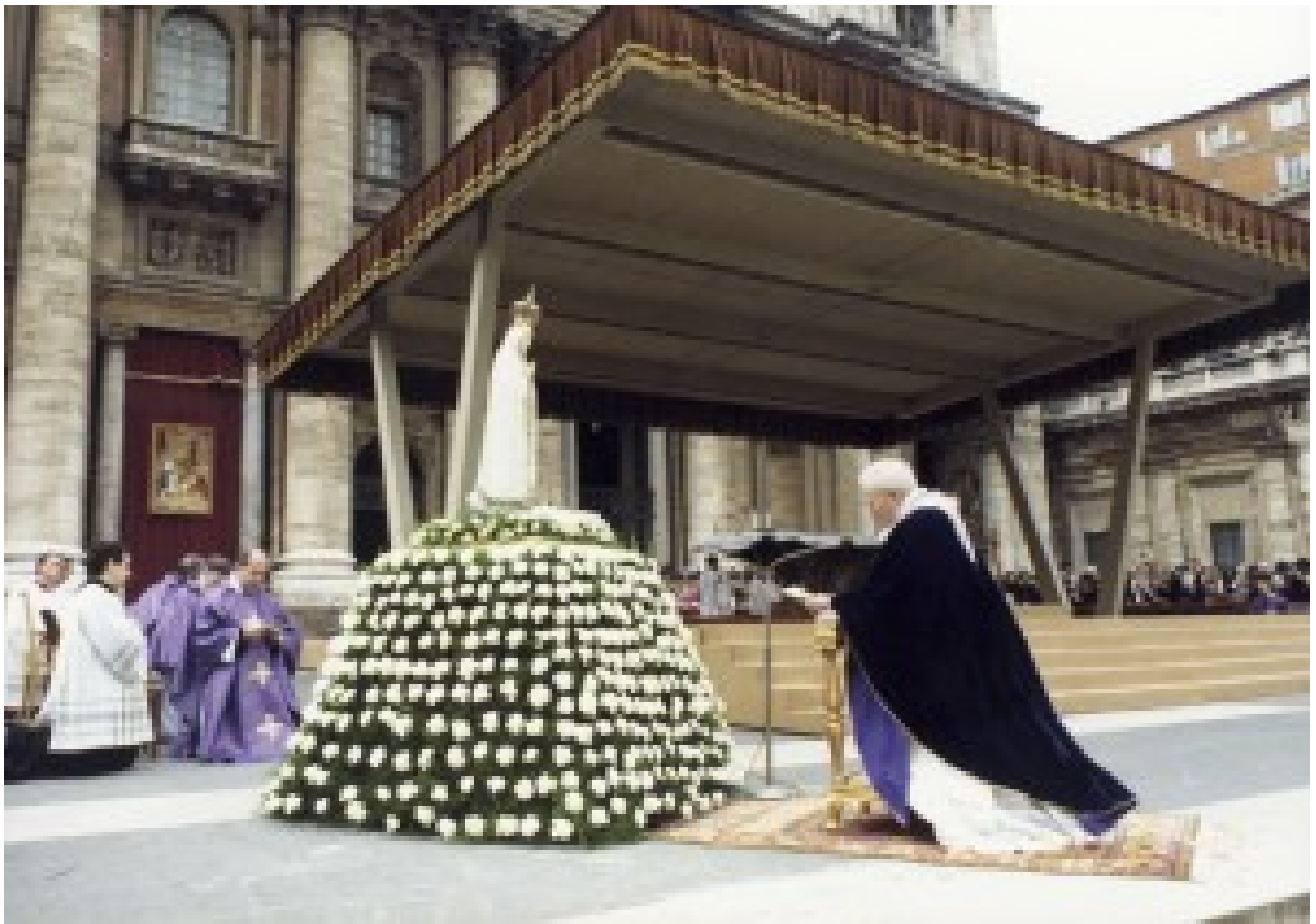
Pope John Paul II Consecrating the World to Our Lady of Fatima

Subsequently, he had the bullet removed from his body sent to Fatima to be placed in the crown of the Virgin statue. Then, on March 25, 1984, he proceeded to consecrate the world to Our Lady of Fatima in union with the bishops. Following that collegial act he then also decided to publicly reveal the much guarded “Third Secret of Fatima” for the first time since it was given to the children in 1917.