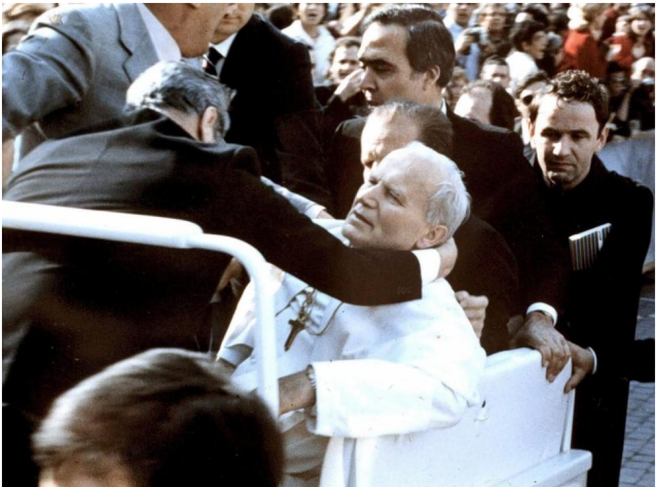
Pope John Paul II Recognized Himself as the Pope Dressed in White in the Third

While recovering in Rome’s Gemelli Hospital he had the Fatima texts removed from the Vatican Archives and personally presented to him. Lying in the hospital, prayerfully studying the Fatima dossier, he recognized himself as the pope “dressed in white” spoken about in the “third secret”, the pope whom Our Lady referred to when she told the children that the “holy father” would have much to suffer, implicitly at the hands of the communists.