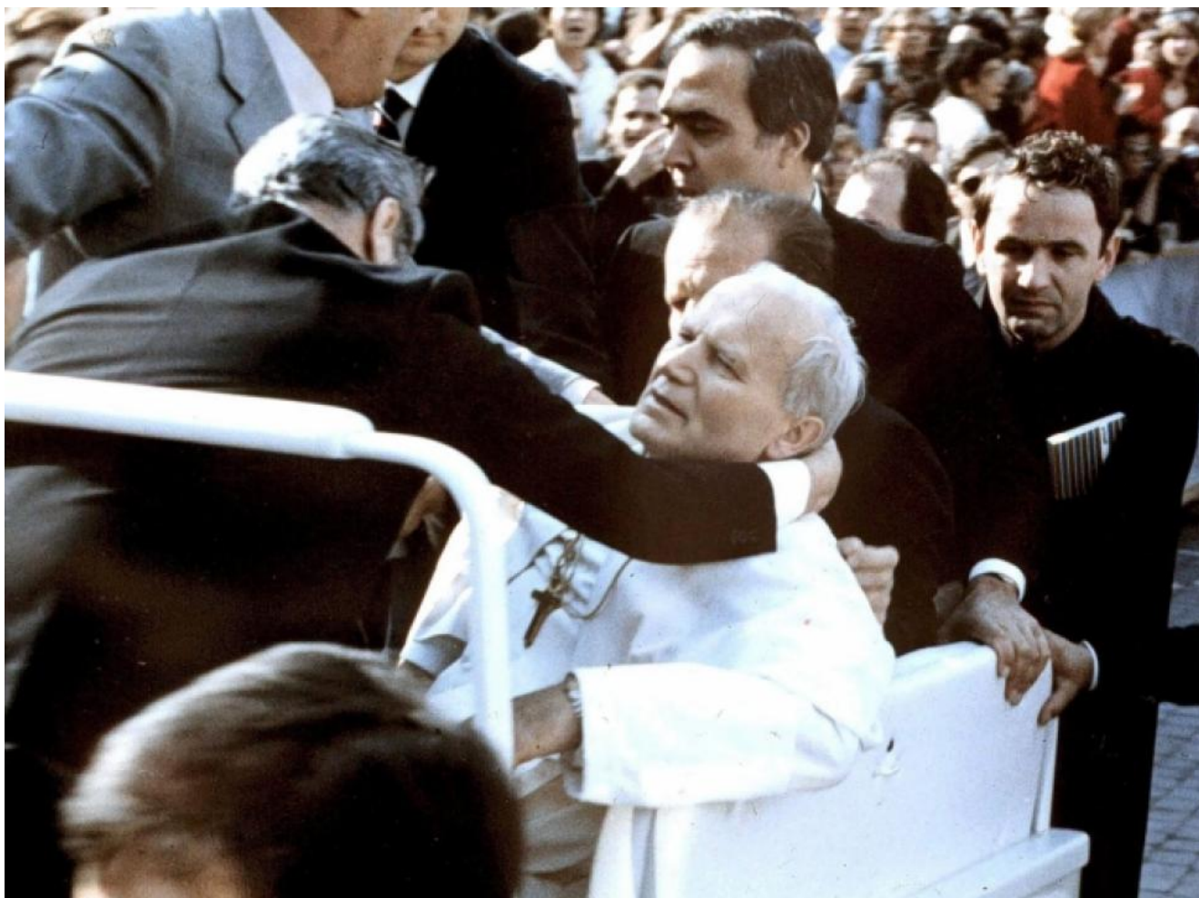
Pope John Paul II Recognized Himself as the Pope Dressed in White in the Third

While recovering in Rome's Gemelli Hospital he had the Fatima texts removed from the Vatican Archives and personally presented to him. Lying in the hospital, prayerfully studying the Fatima dossier, he recognized himself as the pope "dressed in white" spoken about in the "third secret", the pope whom Our Lady referred to when she told the children that the "holy father" would have much to suffer, implicitly at the hands of the communists.