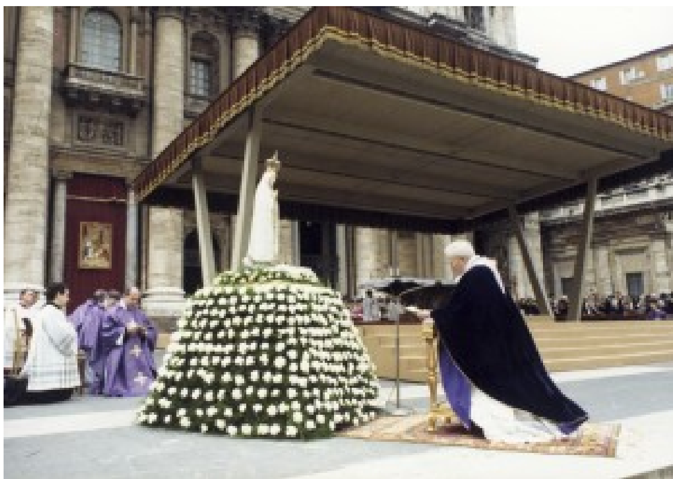
Pope John Paul II Consecrating the World to Our Lady of Fatima

Subsequently, he had the bullet removed from his body sent to Fatima to be placed in the crown of the Virgin statue. Then, on March 25, 1984, he proceeded to consecrate the world to Our Lady of Fatima in union with the bishops. Following that collegial act he then also decided to publicly reveal the much guarded “Third Secret of Fatima” for the first time since it was given to the children in 1917.