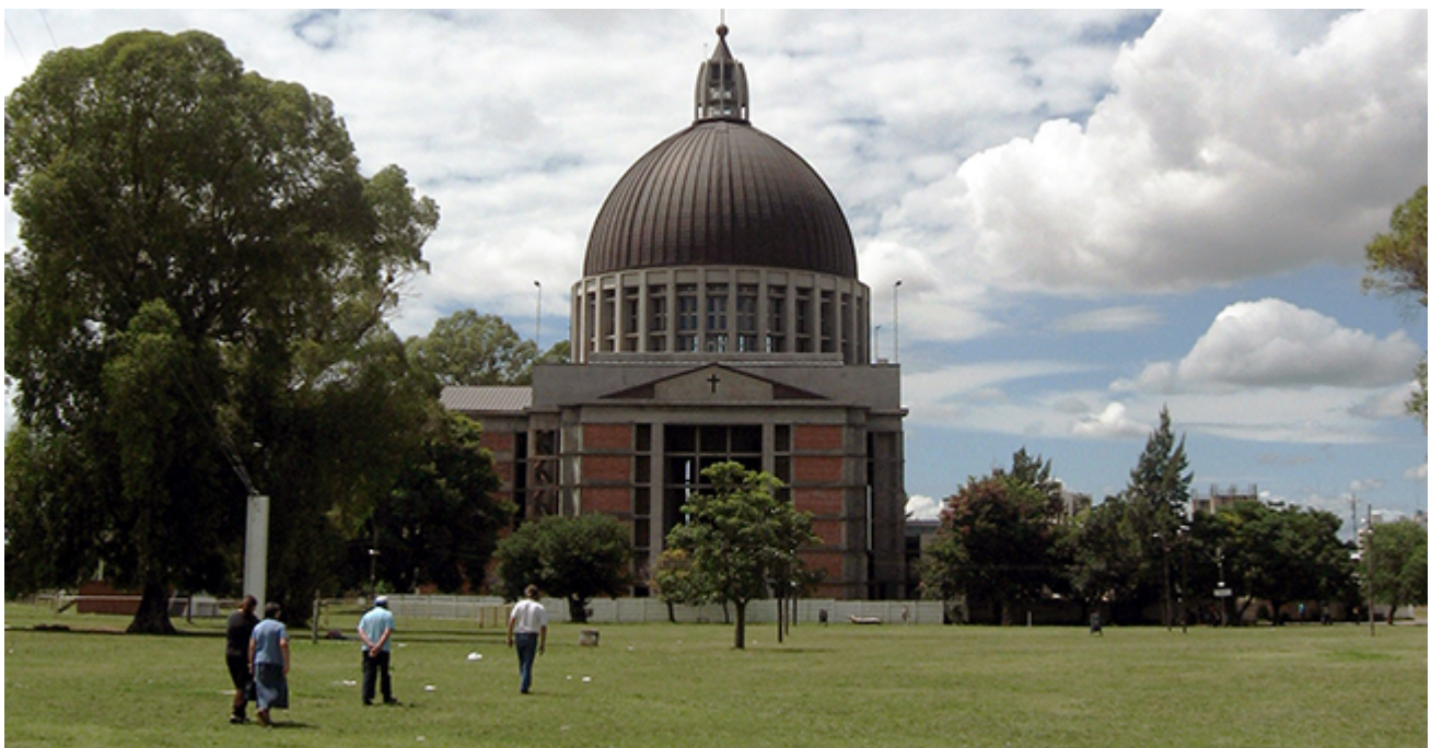
Sanctuary of Our Lady of the Rosary of San Nicholas – Province of Buenos Aires, Argentina