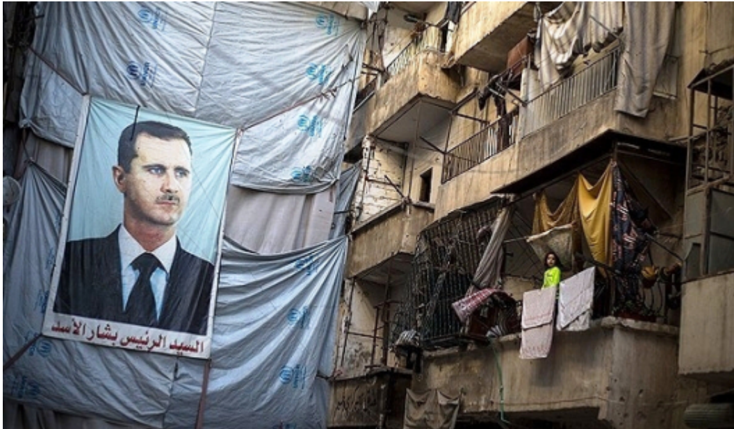
Image of President Bashar Assad Portrayed in eastern Aleppo Being Freed by Syrian Army

Apparently, the Syrians backed by Russia and Iran have the clear advantage and are not about to let go of it. Nor are they overcome with worries about threatened sanctions and wartime propaganda. In-coming President Donald Trump has indicated that he will put a halt to US nation building and interference in the internal affairs of sovereign nations as well as his willingness to work with the Russian against the terrorist rather than with the terrorists against the Russians and the democratically elected leader of a sovereign nation.